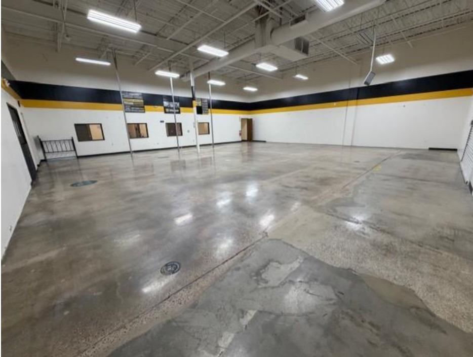
Showroom / Warehouse

101 45 TH ST., STE. A CORPUS CHRISTI, TX