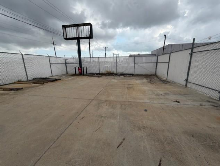
Exclusive Pylon Signage